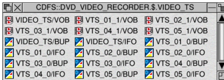
Figure 1 shows the kind of display you get if you load a home-recorded DVD into the DVD drive of a RO machine like my Iyonix. You can see a variety of filetypes.

A few years ago I started using a home DVD Videorecorder along with a DTTV tuner. I like to record 'Classical' and Jazz concert broadcasts, and also some radio plays – for example the recent 'Sherlock Holmes' series on BBC Radio 4. My main interest is often in the sound, with any video being a bonus. One of the advantages of making sound recordings using a DVD recorder is that it can allow recordings for up to 4, 6, or even 8 hours onto a single disc. For long events, or series of programmes, this is more convenient than recording onto Audio CD which limits you to 80 mins per disc. This set me wondering: Was it possible to extract the audio and keep that without the video? Would I be able to then use the audio in 'data compressed' format and store more on a CDR or DVD+/-R?... Since I'm writing this article you can guess already that the answers to the above questions are 'yes!'. To explain how, it's useful to start with a basic explanation of how video recordings are stored on DVD.